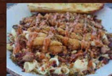
MAC-ATTACK CHEESE BOWL

Two seasoned, breaded chicken breasts baked with zesty marinara sauce and melted provolone and mozzarella cheeses. Served with a side of spaghetti.