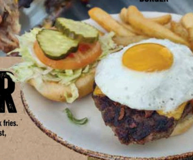
FALCONE BREAKFAST BURGER

All burgers can be made as a wrap for an additional charge.