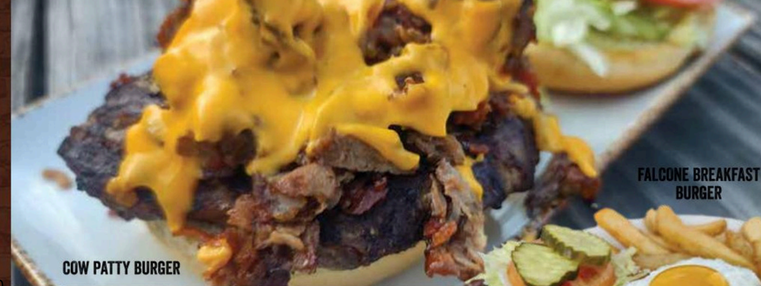
COW PATTY BURGER