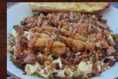
MAC-ATTACK CHEESE BOWL

Two seasoned, breaded chicken breasts baked with zesty marinara sauce and melted provolone and mozzarella cheeses. Served with a side of spaghetti.