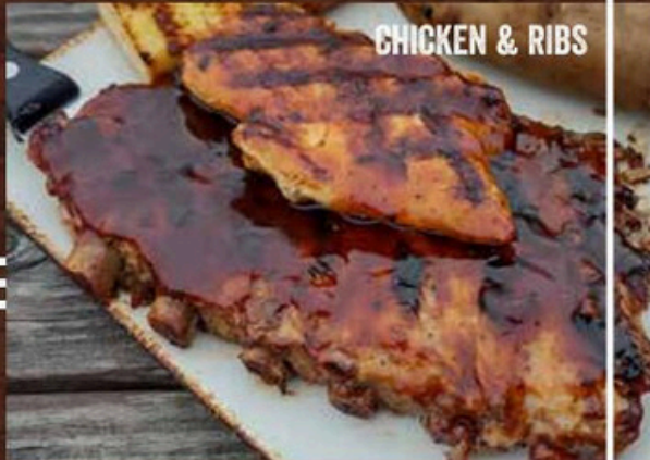
CHICKEN & RIBS

A juicy 10oz Kansas City sirloin steak chargrilled to perfection and accompanied by 5 breaded shrimp.