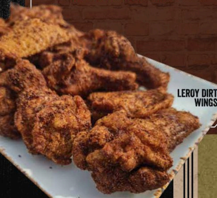
LEROY DIRT WINGS

New! RANCHERO Where homemade ranch meets our hearty bacon!