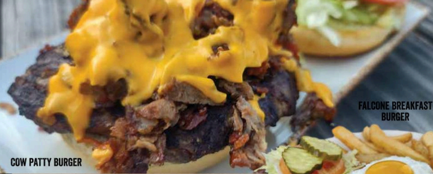
COW PATTY BURGER