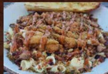
MAC-ATTACK CHEESE BOWL

Two seasoned, breaded chicken breasts baked with zesty marinara sauce and melted provolone and mozzarella cheeses. Served with a side of spaghetti.