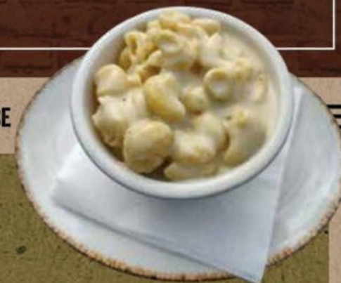
MACARONI & CHEESE

Scrambled eggs topped with ham, bacon, green peppers, onions, sausage, cheddar, mozzarella and provolone cheeses.